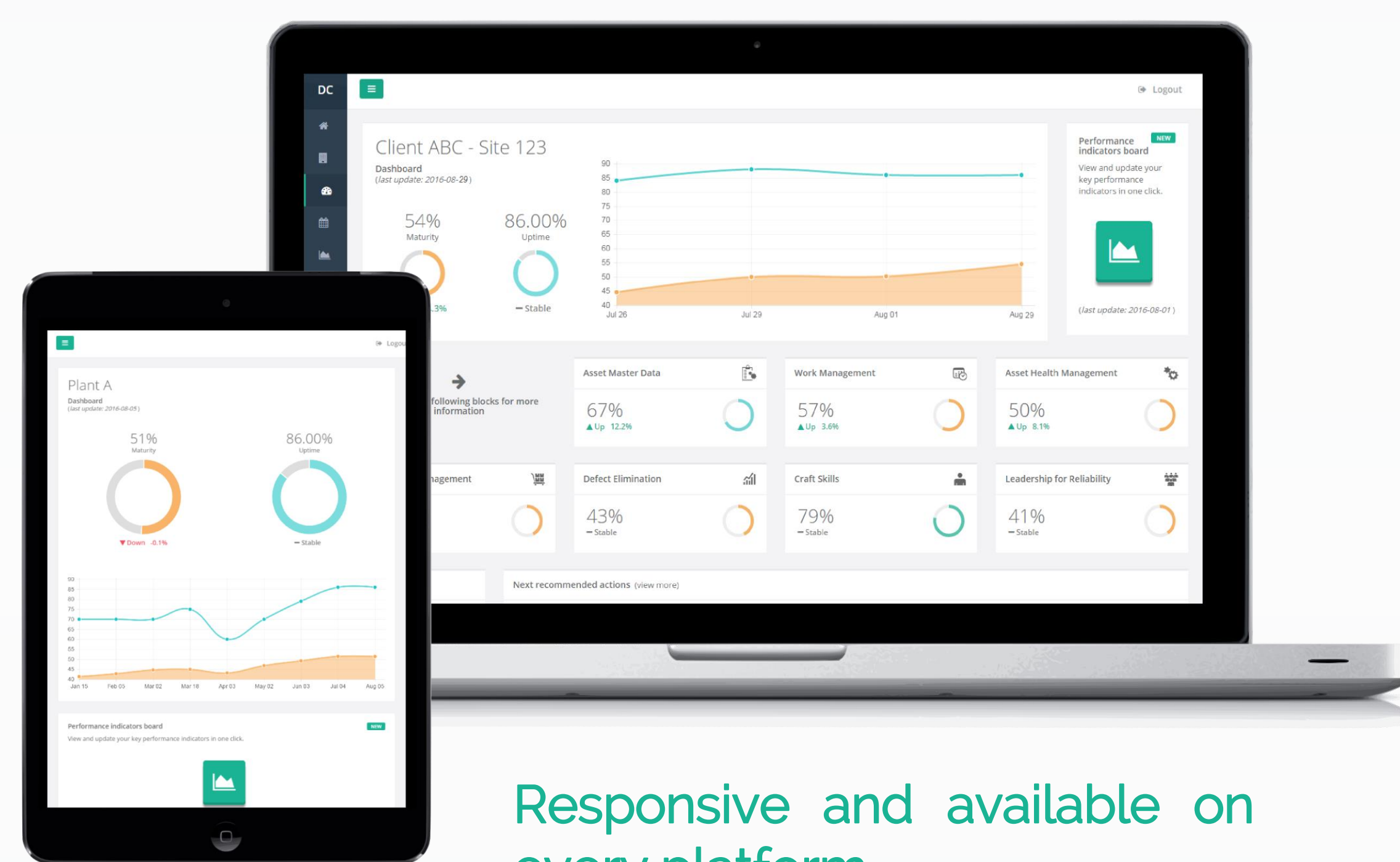
Responsive and available on every platform